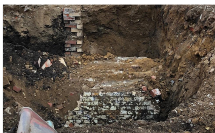
Obstructions found in the ground