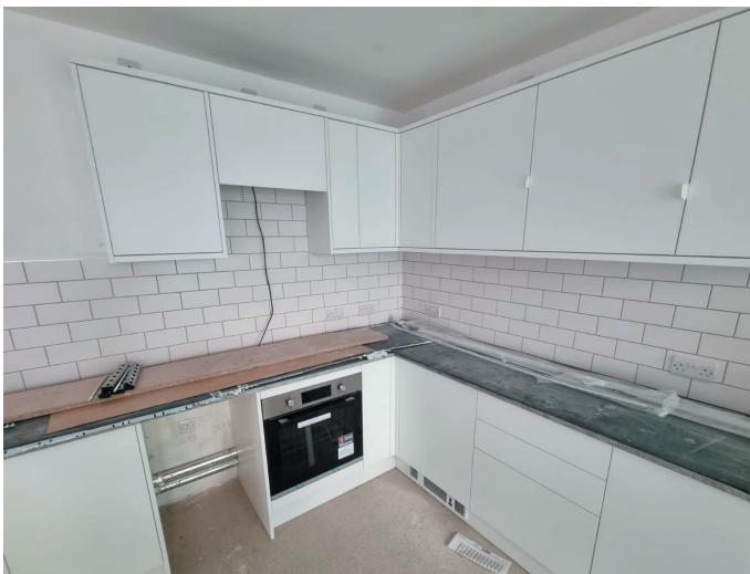
Level 3 (Flat 1) kitchen