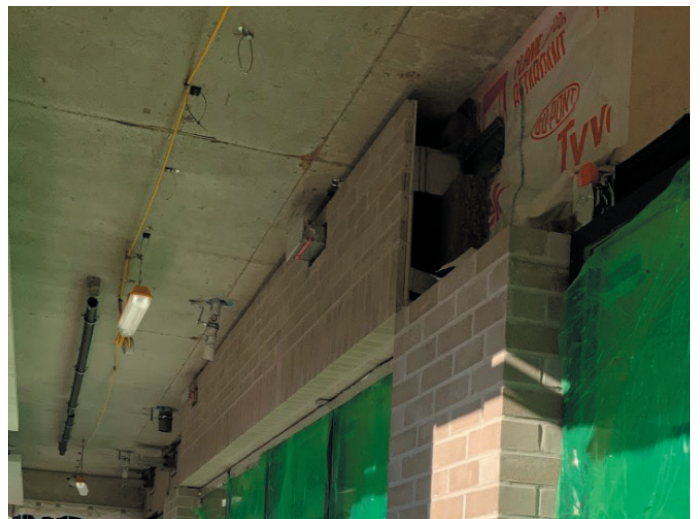
Level 3 (Flat 2) fablite installation