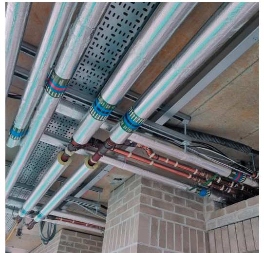
Level 5 (Flat 5) low temperature hot water / sprinkler and cold boosted water connections to walkway