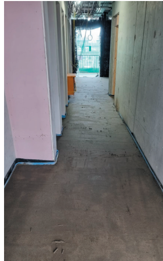
Level 8 lift lobby - screeding