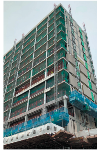
Brickwork and glass reinforced concrete