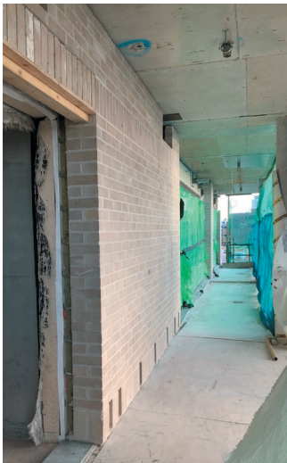
Brickwork at level 6