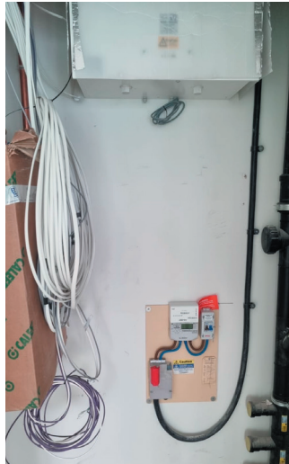
Level 6 heat interface unit (EON metering)