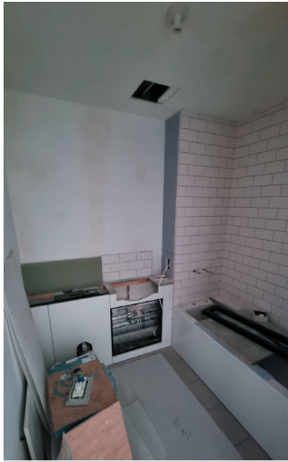
Level 3 (Flat 1) bathroom

Below is a collection of construction images, capturing the progress that has recently been made.