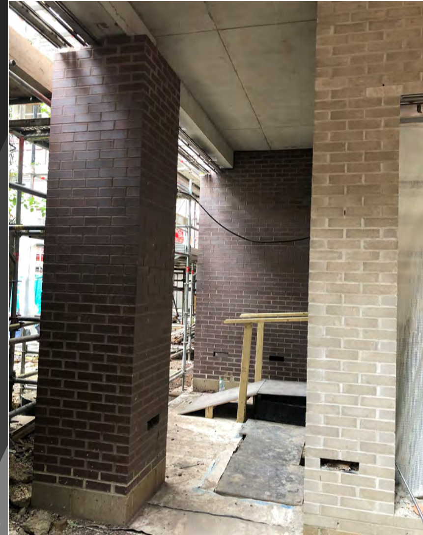
Right : Main school entrance