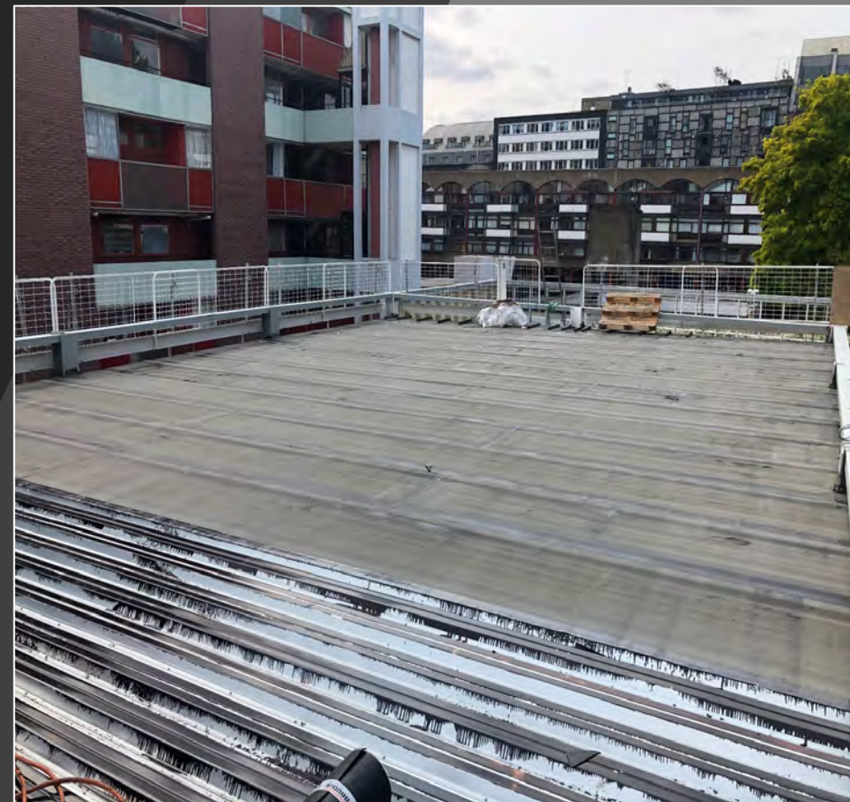
Left: Main School