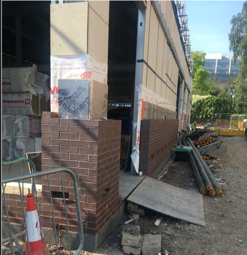
Left: Sports Hall