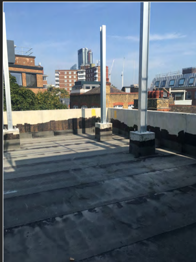
Right: Sports Hall