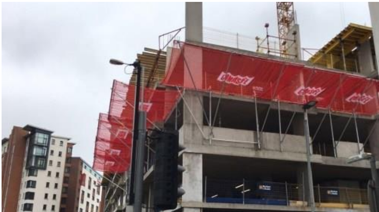
Precedent image of netted fan