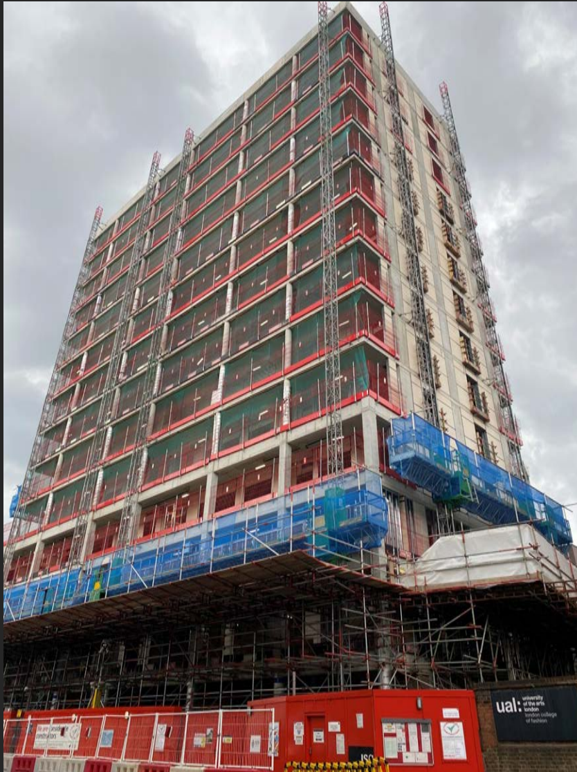
Residential Tower – East elevation