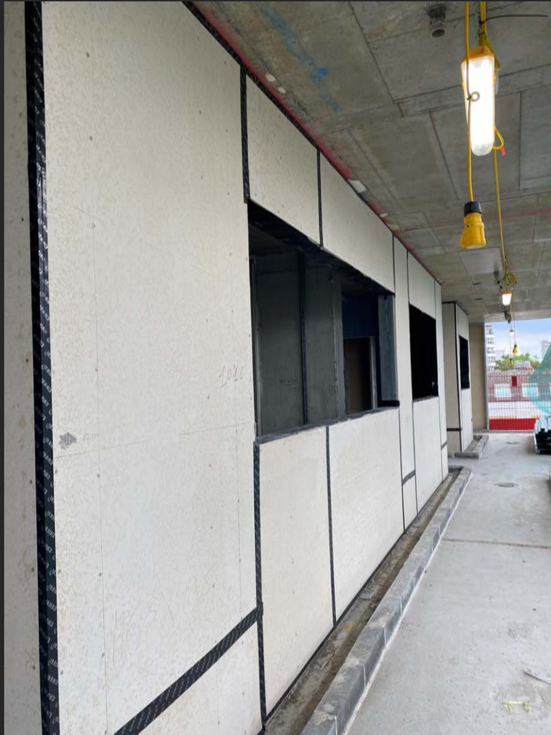
Metsec walls being built