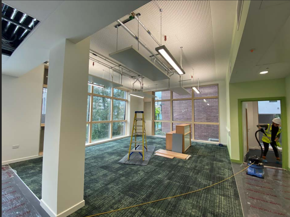
LRC on the first floor of the School Building