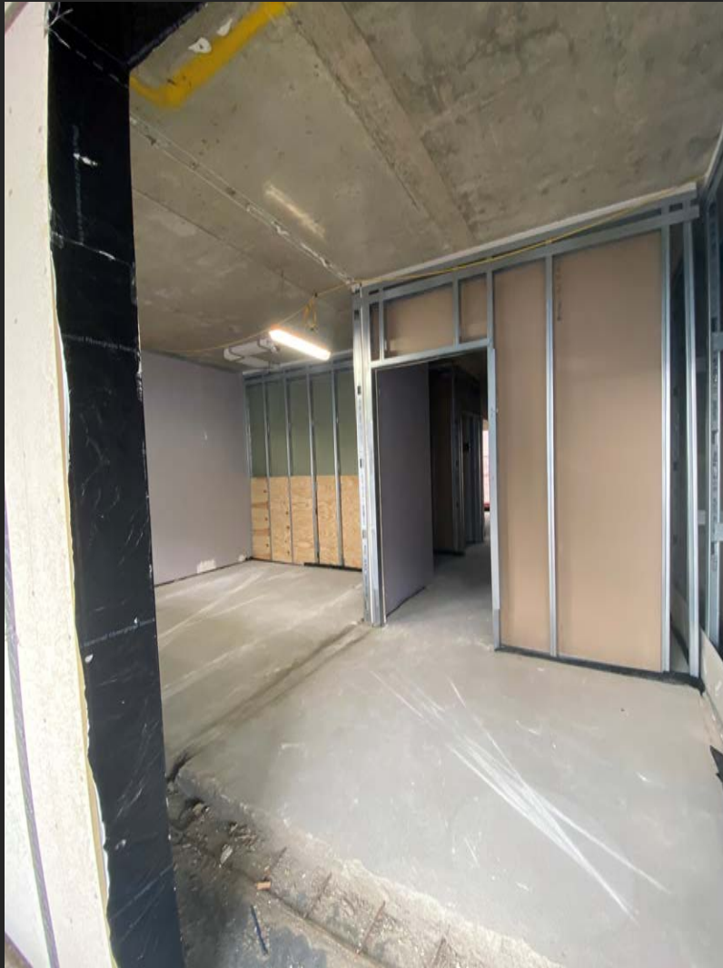
First fix flats